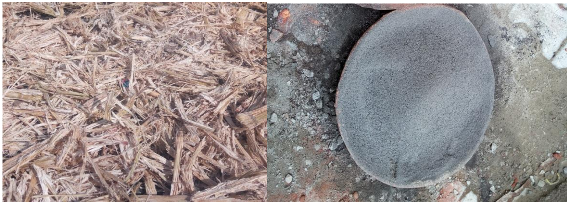
Figure 01 Sugar cane

(5) Brick dust: The underlying phases of preparing calcined earth pozzolanas are indistinguishable to the embellishment and terminating process for mud bricks, tiles or stoneware, and generally the rejects from these businesses have been utilized as pozzolanas.