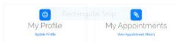
Fig.3: Dashboard of the Lawyer