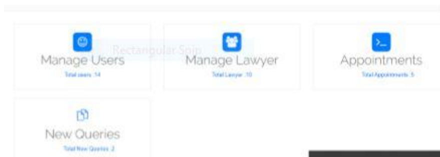
Fig.4: Dashboard of the Administrator