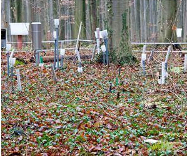
Figure 2:- wireless network collecting the recordslike soil and leaf humidity data and air temprature.