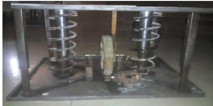
Figure 2: Model of the proposed design.

The components used in proposed work is suspension system, rack and pinion, gear drive, drive shaft and generator. Figure 2 shows the actual model of the design.