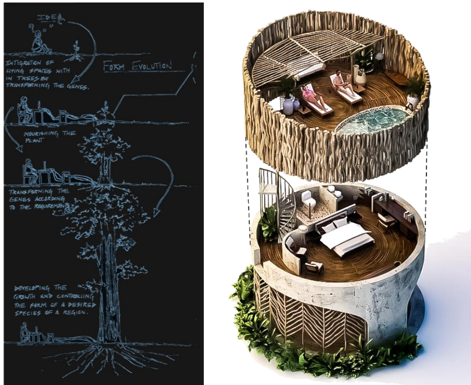
Figure 1: Model of conceptual exploration and integration of natural phenomenon