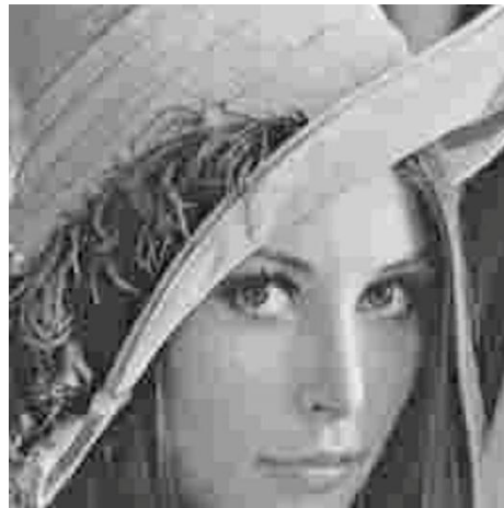
Figure 1. Image with Blocking artifacts

the noisy artifacts called as blocking artifacts, it is because of the independent processing of each block. In the process, block by block each block is transformed, quantized and coded independently. The correlation of the adjacent blocks decreases as the compression is increased. Therefore an artificial boundary starts appearing along the vertical and horizontal sides. These square shaped structures are called as blocking artifacts which increase their appearance as the compression increases. Compression effects of the transformed images can also be categorized as false contours visible in the area of slowly varying intensity, Grid noise in the monotone areas, Corner outliers at the corner points ,Stair case noise along the image edges and Disturbing blocking etc.