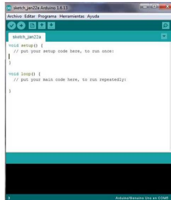
Figure 5: Arduino IDE

Arduino integrated development environment (IDE) is a cross platform application. It is an open source application which means anyone can download it for free and program it as per their will.