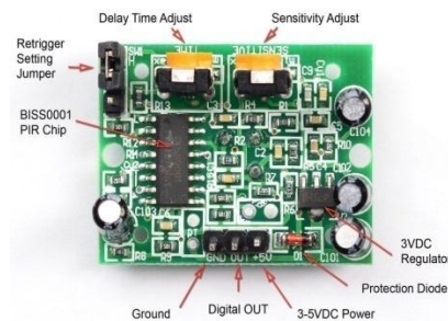
Figure 2: PIR (Passive Infrared Sensor)

PIR stands for passive infrared sensor is an electronic sensor that measures the infrared light being emitted by an object. They are generally used for motion detectors. PIR is used to detect movement. An individual PIR sensor detects change in amount of infrared radiation when some object comes and pass there is change in infrared radiation which change into an output voltage and this trigger the detection[7]. PIR have an angle of detection of 120 degree for sensing any change in infrared radiation. In this circuit as soon PIR senses any kind of change in heat radiation it makes output high which is given to Arduino as an input and further depending upon whether circuit is working in home automation or home security is will switch ON appliances or buzzer respectively.