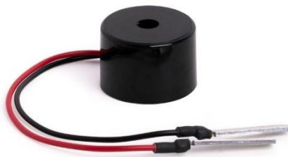
Figure 4: Buzzer

A buzzer or beeper is an audio signalling device, which may be mechanical, electromechanical or piezoelectric.