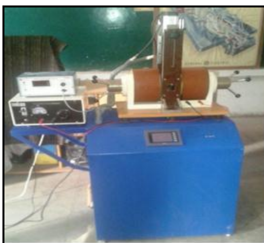
Fig. 1 Views of the set up