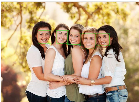
Face Detection Using Image